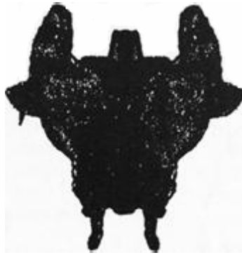
Figure 5.2: An inkblot or... ?

study of imagination, Bartlett noted that subjects asked to interpret inkblots frequently reveal much information about their personal interests and occupation. For example, the same inkblot reminded a woman of a “bonnet with feathers,” a minister of “Nebuchadnezzar’s fiery furnace,” and a physiologist of “an exposure of the basal lumbar region of the digestive system.” 2 See Figure 5.2: what does the inkblot look like to you?