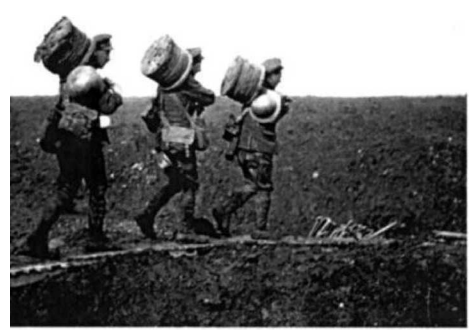
Royal Engineers carry telephone cable along ri aijgnkboard track in Fla Maddox said of the task, "h a bloody ftteM'

After an overnight stay at the village of Lutterworth, close to the motorway, 1 arrived in Harrogate by lunchtime and headed directly for the reference room of the Harrogate Public Library, I was fortunate enough to find an Ordnance Survey map, drawn in 1850, of the area around Pate ley Bridge and Heathfleld. It was a magnificent map, six inches to the mile and crammed with detail—every field, trough, well and shed was marked and every farmhouse mentioned by name, Even sheepfolds were designated, an inclusion that confirmed sheep farming as the predominant farming activity.