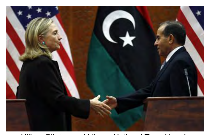
Hillary Clinton and Libyan National Transitional Council Prime Minister Mahmoud Jibril in Tripoli (10/18/11; photo credit: Reuters).

Clinton's leading role on Libya was on display as soon as the rebellion against Muammar Gaddafi got underway. While other foreign Heads of State visited Libya in 2011, President Obama had Secretary Clinton represent the United States because of the leading role she had played in the NATO-led intervention that had resulted in the overthrow of the Gaddafi regime<sup>5</sup>.