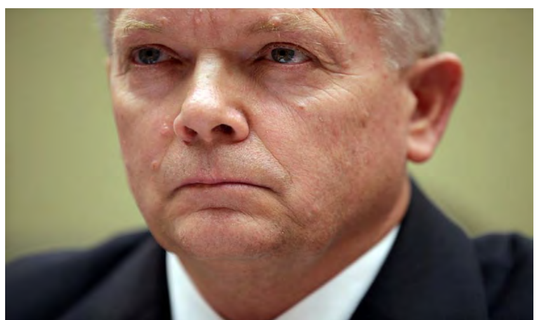
Acting Deputy Assistant Secretary of State for Counterterrorism Mark Thompson testifies before the House Oversight and Government Reform Committee (5/813).

The FEST is described as "the US Government's only interagency, on-call, short-notice team poised to respond to terrorist incidents worldwide.'... Yet deployment of the counterterrorism experts on the FEST was ruled out from the start. That decision became a source of great internal dissent and the cause of puzzlement to some outsiders... While it was the State Department that's said to have taken FEST off the table, the team is directed by the White House National Security Council...In the end, Obama administration officials argue that its quick deployment would not have saved lives because, while the U.S.-based team might have made it to Tripoli, Libya, before the attacks ended, they most certainly wouldn't have made it to Benghazi in time. Still, nobody knew at the outset how long the crisis was going to last."