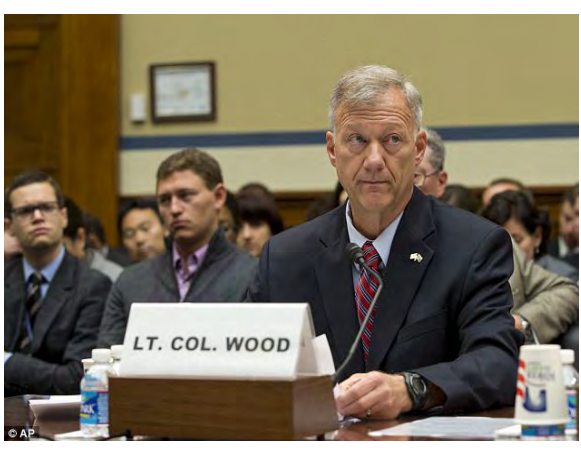
Lt. Col. Andrew Wood testifying before the House Oversight & Government Reform Committee (10/10/12).

Lt. Colonel Andrew Wood, the Site Security Team (SST) Commander in Libya from February to August of 2012, testified that beyond denying requests for additional security, existing security was actually cut.