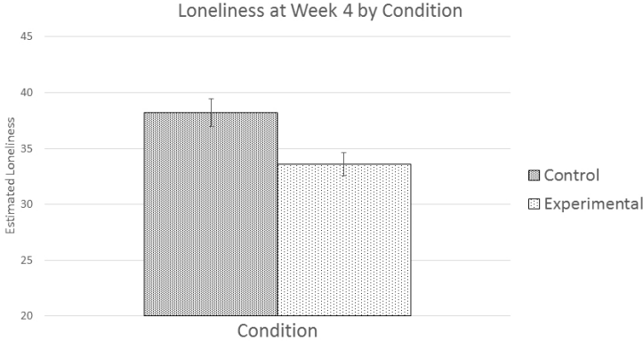
FIGURE 2. Loneliness at week 4 by condition.

cantly lower on the UCLA Loneliness Scale at the end of the intervention, F(1,111) = 6.896, p = .01 . See Figure 2.