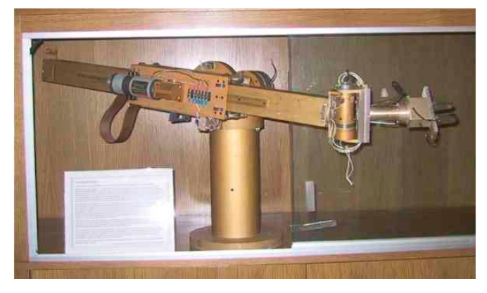
Fig. 3 – Robot constructed by Walter Grey, University of Bristol.