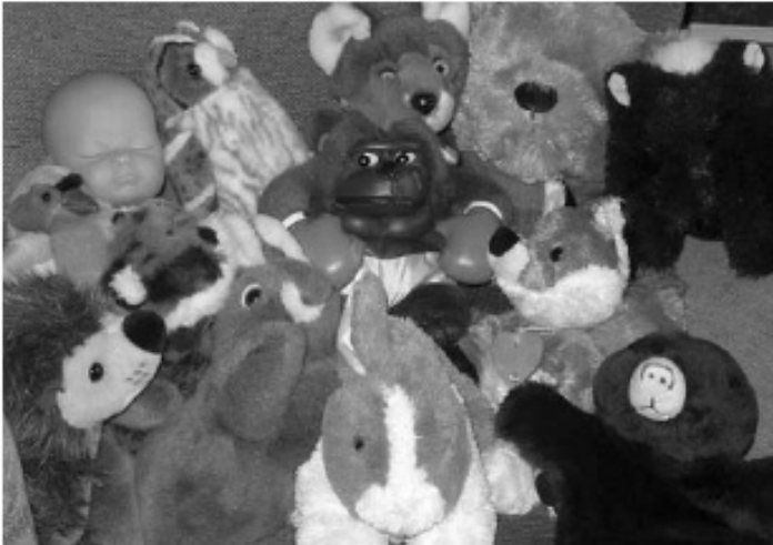
Figure 1. Toys used in my therapy room.

I find that engaging in exploration, creative “play”, and symbolic communication is part of the upside of my work. I have a small collection of toys in my therapy room (Figure 1), along with paints, clay, storybooks, and various symbolic objects which adult clients often use to work on restructuring their internal attachment systems. As the internal relational structure represented in toys or other materials changes, the narrative also changes. Then the toys and materials are no longer needed and are put away or bequeathed to my collection, which, for this reason, is growing.