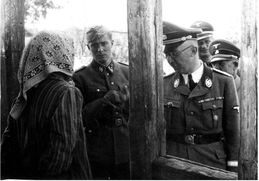
LVI Himmler speaks with a Jewish woman