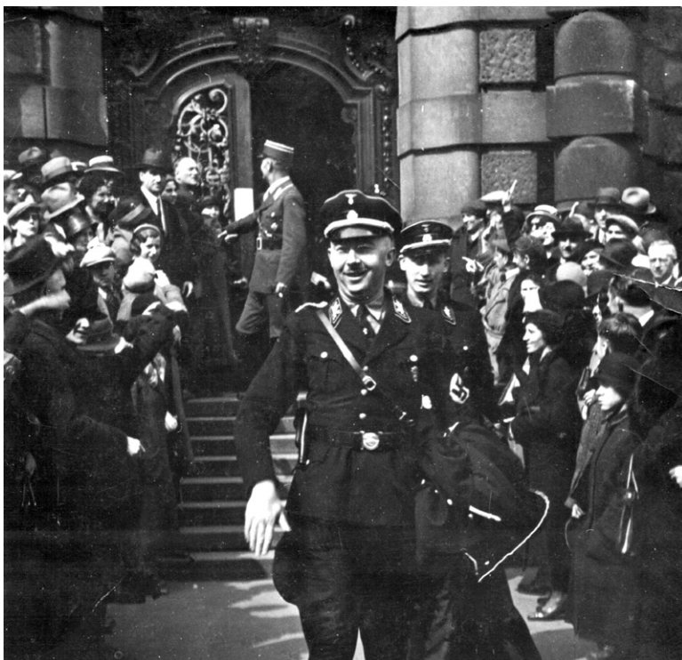
L Himmler and Heydrich in Munich