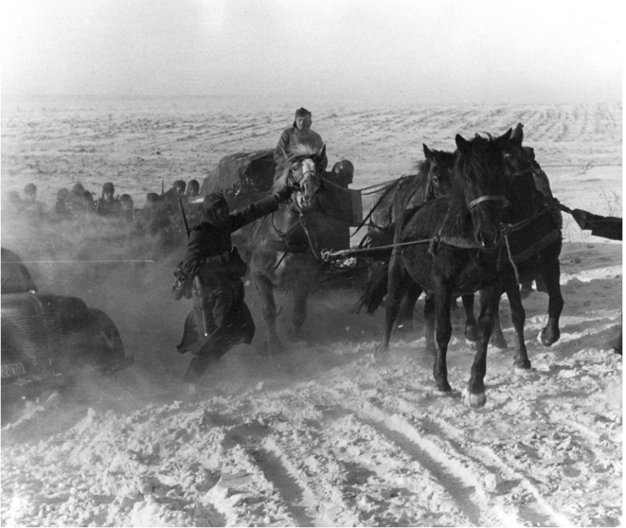
XLVIII Horses deployed to move army units in the harsh winter of 1941