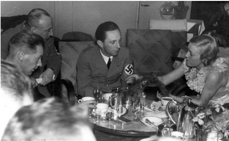
LII Terboven, Goebbels, and Ilse Stahl