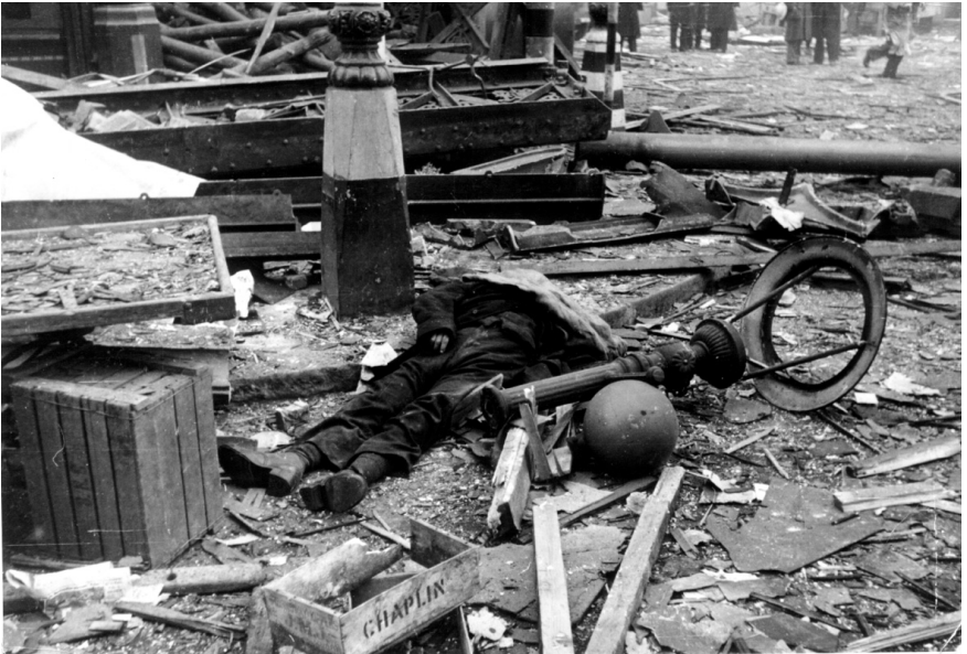
LXII The ravages of war