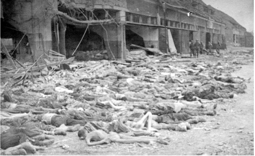
LXI Starved corpses outside a bombed-out building