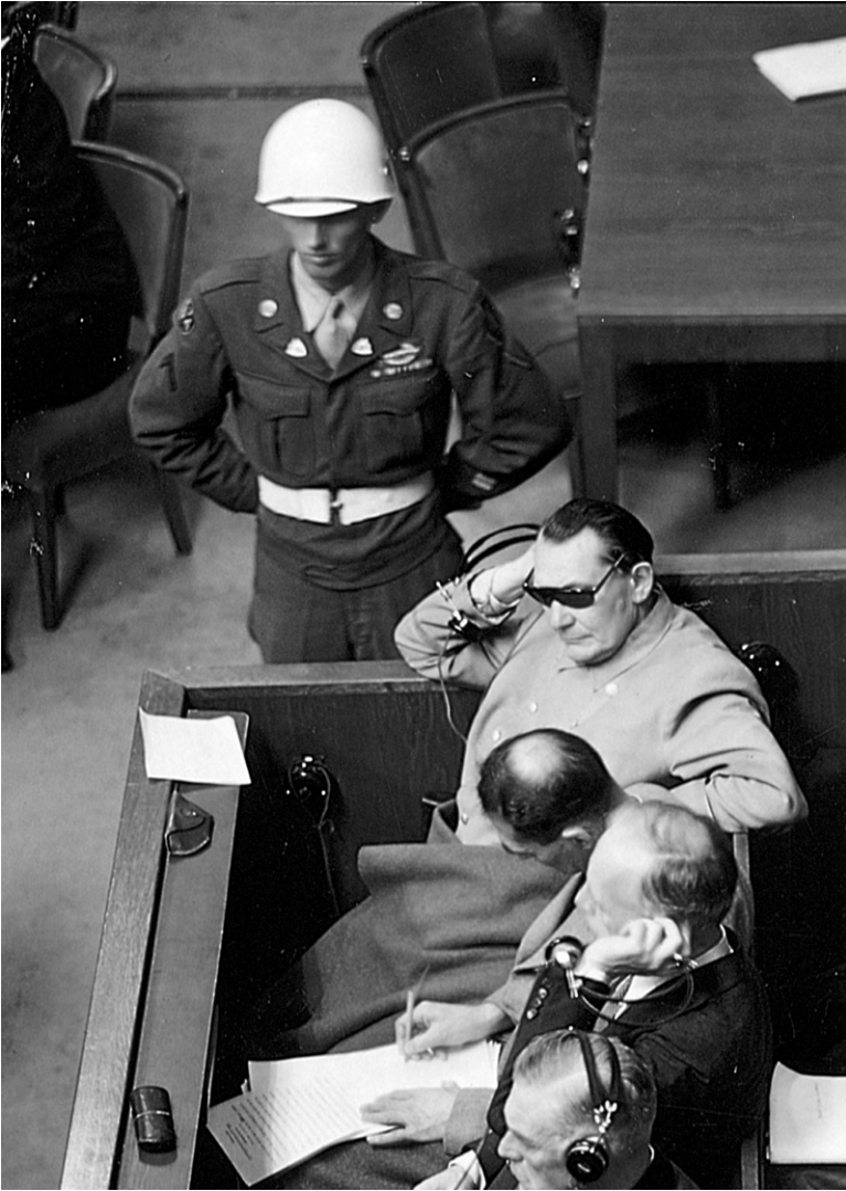
LXVIII Göring, Hess, Ribbentrop, and Keitel in the prisoners' dock