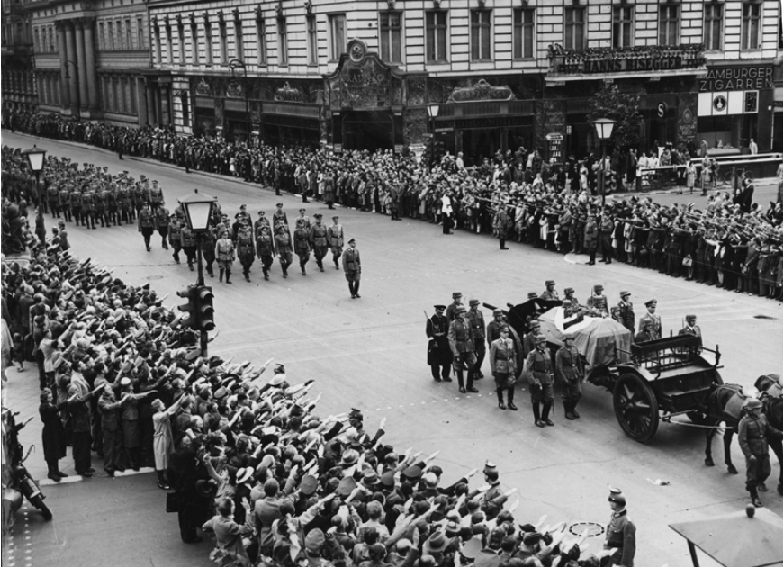
LV Heydrich's funeral