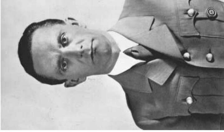
LIV Portrait of Goebbels