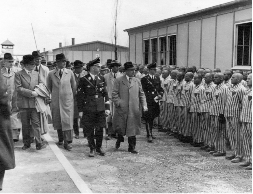
LVII Himmler at Dachau concentration camp