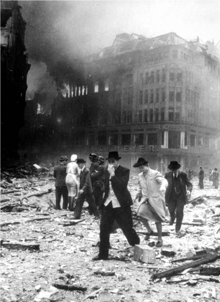
LX Hamburg on fire