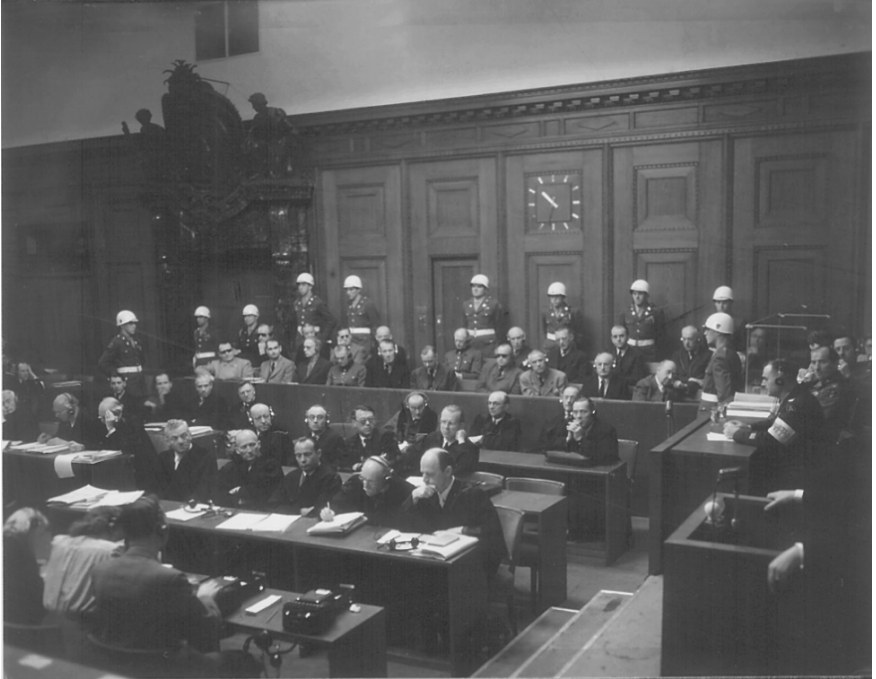
LXVII Prisoners in the dock at International War Crime Trials