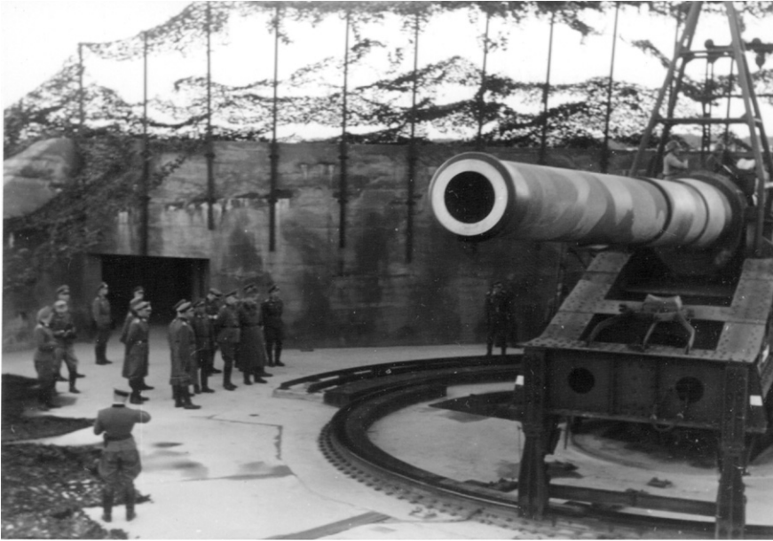
XLIX Rommel at the site of a gun emplacement