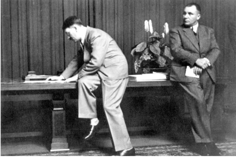
LVIII Hitler with Bormann