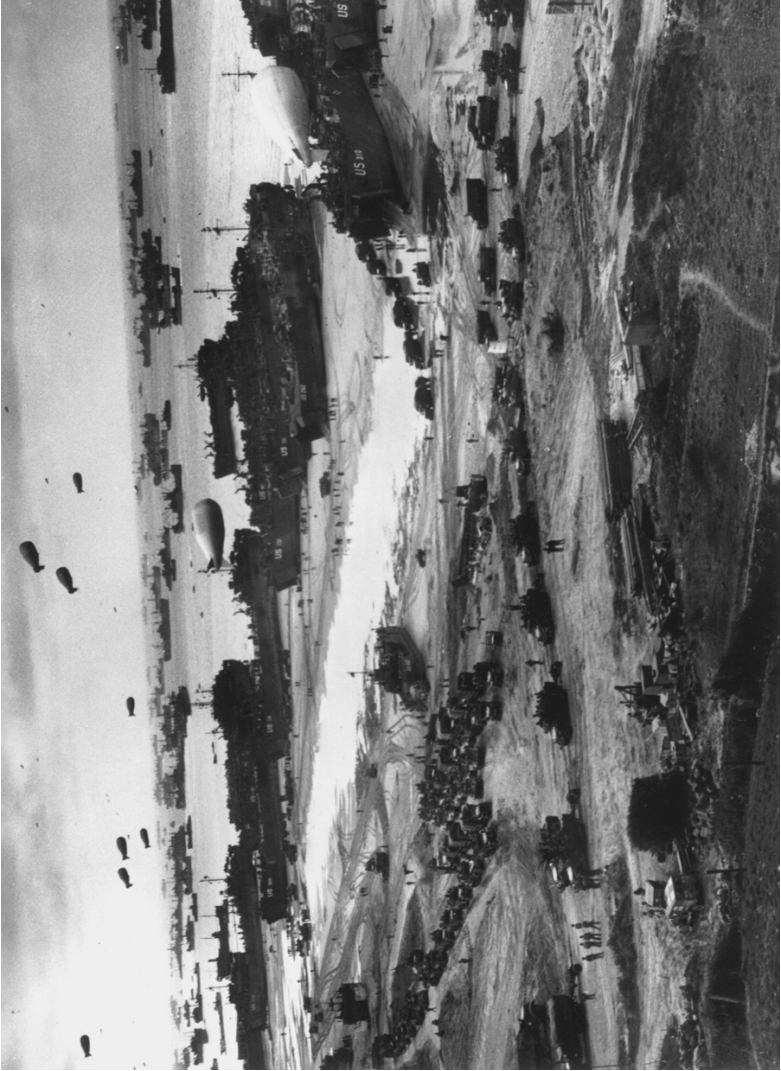
LXIII Invasion of Normandy on D-day