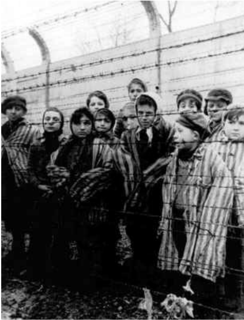
LXVI Auschwitz liberated