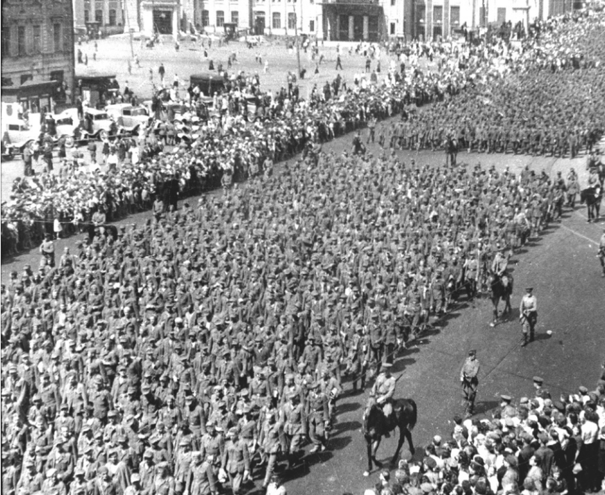
LXV German prisoners of war marched through Moscow, captured in battle of Army Group Center, 1944