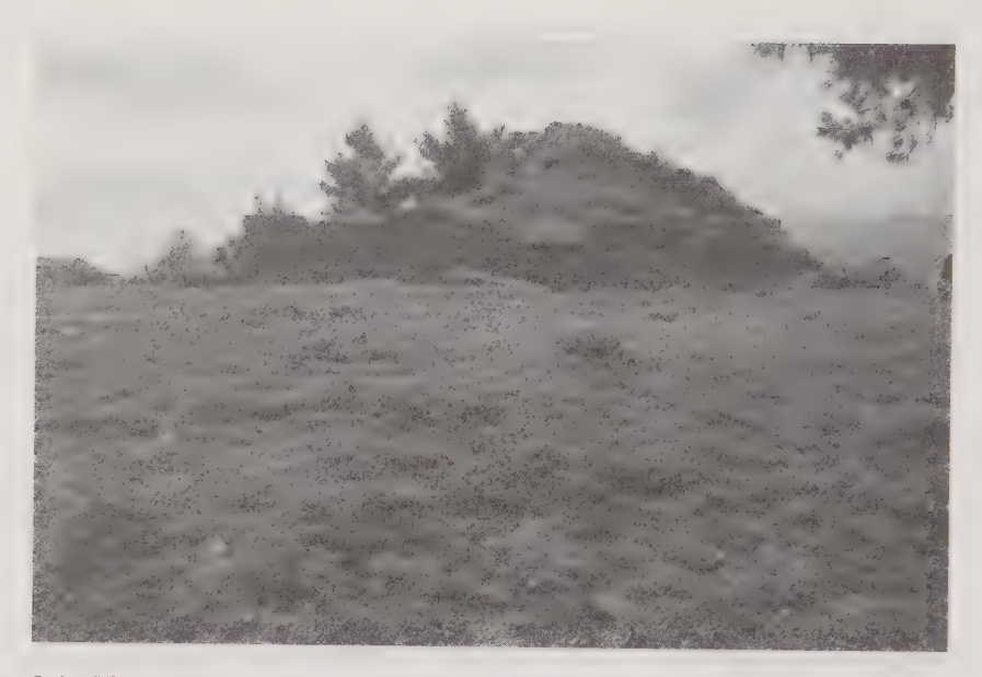
3.1 The temple and terrace of the Menelaeum

river valley on the east with hilly yet fertile lands stretching westwards to the sea, Messenia was a prize acquisition. Its agricultural wealth, worked by an enslaved population for their absentee overlords, provided Sparta at the fifth-century apogee of its power and influence with the means to maintain the nearest thing to a standing army in Greece by freeing all its adult male citizens from the need for manual labor. Messenians would remain under Spartan rule for centuries, until the Theban general Epaminondas liberated them in 369 B.C.E., two years after the disaster at Leuctra.