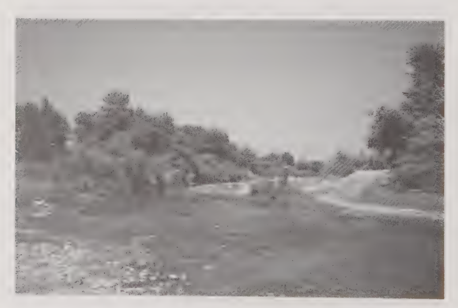
1.1 The Eurotas river south of Sparta

The Spartan heartland extended outwards from the banks of the Eurotas in a valley approximately 12 km wide at its greatest extent and 22 km long. Formed by a massive subsidence before the Pliocene era (more than 5.332 million years ago) and subsequent erosion on the valley's sides accompanied by flooding by the sea, the valley floor was covered by marine deposits, which were in turn overlaid by fans of alluvial sediment. Soil derived from this layer was the basis of agriculture in the region during antiquity. Fertile and well watered both by the Eurotas itself, one of the few Greek rivers that still flows during the summer, as well as by streams flowing from Taygetus, the valley today produces abundant crops of olives, citrus, and a variety of vegetables, using large-scale irrigation.