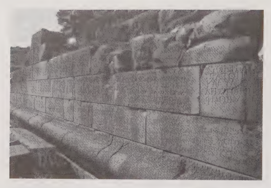
10.2 Inscriptions on the east parodos wall of the theater

Doric colonnade flanking them methodically smashed into tiny pieces. In its place, the Spartans erected a Roman-style scene building in 78 c.e. with financial support from Vespasian ( IG V.1 691). The emperor also attempted to settle the continuing dispute over the Dentheliatis by having Sparta's western boundary surveyed, setting it on the contentious territory's eastern side ( IG V.1 1431).