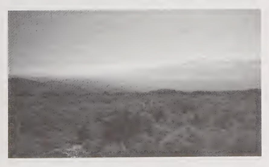
1.2 The Eurotas valley from the north

The valley today is shut off from the sea by a line of hills, known as Vardounia, which springs from Taygetus on the west and ends at the course of the Kourtaki near the modern village of Krokeai. The main ancient and modern route through these hills reaches the port town of Gytheum on the Laconian gulf, which was Sparta's major maritime outlet. The dramatic topography of the northern part of the Eurotas valley, where the two mountain ranges draw together, is best appreciated on the modern highway to Sparta, which after climbing slightly to leave the Tripolis plain and threading through the rocky uplands