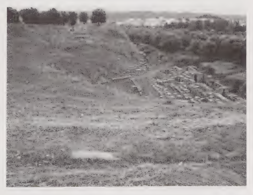
10.1 The early Roman theater on the acropolis

The fall of the Euryclids under Nero marked the end of an era, and political life, dominated by various elite families, soon came to resemble that of other cities in the eastern empire. Symbolic of the change from one-man rule to the status of a normal provincial city was the fate of Eurycles' impressive marble theater. Only under the Flavians did public catalogs of magistrates and careers of prominent notables begin to be inscribed on the eastern retaining wall. The theater's unique feature, a scene building that could be rolled in and out of sight as needed, was removed, its stone rails either removed or covered over, and the