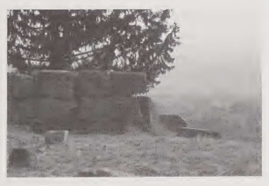
2.1 Remains of the Amyclaeum

On the other hand, breaks in the depositional record like those at the Amyclaeum cannot be ignored, though their interpretation can