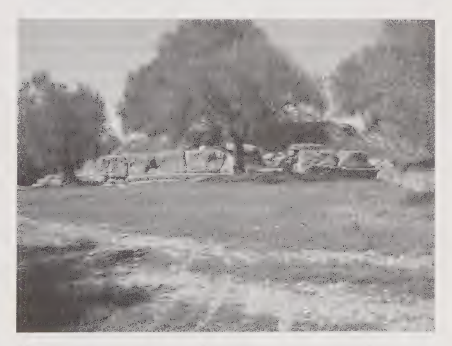
8.1 The "Round Building," now identified as the Chorus, site of the Gymnopaediae dances

Xenophon thought the choruses and gymnastic competitions of the young men at Sparta worth hearing and seeing ( Lac. 4.1–7); they were manifestly an important part of the city's training of its future citizens. The military advantages gained from a practical knowledge of music and dance are apparent in incidents such as at Amphipolis in 422, when Brasidas' practiced eye noticed, from the uncoordinated movement of their heads and spears, that the Athenians outside the walls could not withstand a direct assault (Thuc. 5.10.5).