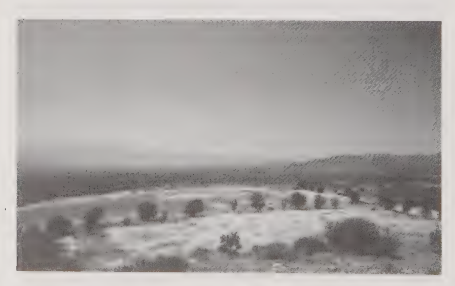
5.1 View west from the acropolis of Geronthrae to the Eurotas valley

Distance is another factor weighing against Geronthrae specifically being a major supplier of finished goods for Sparta. A similar objection can be made against the site of Analipsi in northern Laconia as the sole source of Laconian red-figure pottery, a local substitute for the more famous Athenian variety, which began during the Peloponnesian War and ended in the 370s. That cartloads of goods (especially breakable pottery) trundled from specifically designated production centers along rough roads over quite long distances to market in Sparta presupposes a highly developed road network and a centralized, even command, economy that would have been impossible to maintain given the administrative resources available at the time. The majority of objects produced at these and other as-yet-undiscovered places were far more likely normally for local use and trade within a quite restricted area. Notable exceptions to this rule would be luxury objects of bronze like the vast, highly decorated wine-mixing bowl ( kratêr ) commissioned by