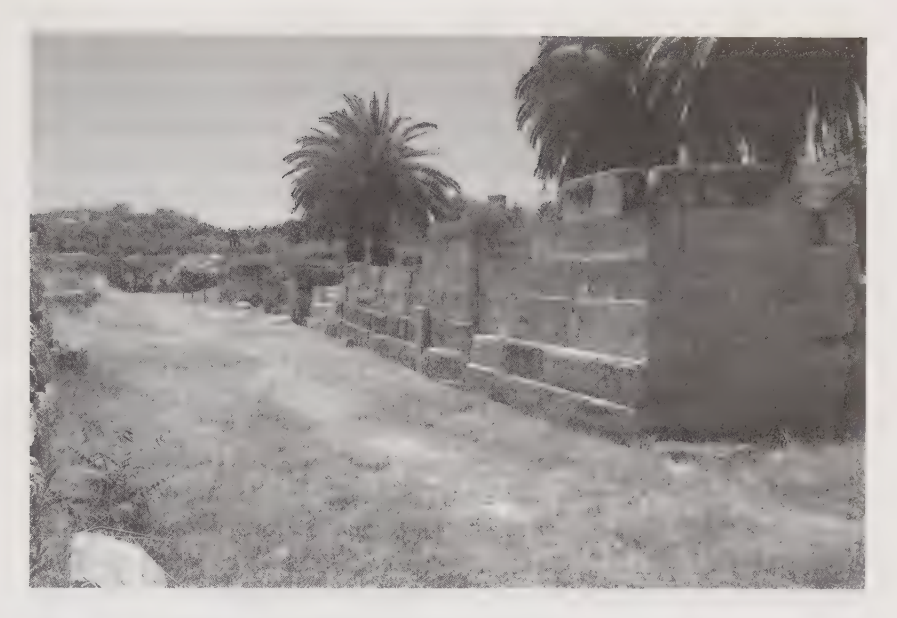
8.2 The Tomb of the Lacedaemonians in Athens

uniform. In addition, Spartan hoplites wore light chest protection of quilted linen or leather instead of bronze cuirasses. The evidence for standardization raises the question of procurement. How did individual Spartans acquire their weapons and armor? Historians incline towards a central distribution agency, especially since we know that the state replaced and repaired the equipment of soldiers on campaign (Xen. Lac. 11.2). In such a system, the perioeci would logically have provided the craftsmen to manufacture the articles to Spartan specifications.