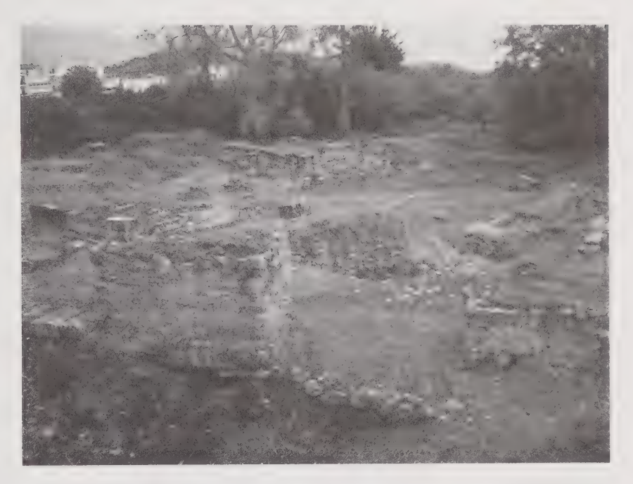
10.3 Remains of the temple and amphitheater at the sanctuary of Artemis Orthia

Laconian economic life. Of the copies of Diocletian's price edict found in Laconia, no fragments come from Sparta or its immediate neighborhood, signifying that it had ceased to be a commercial center. The cult of Artemis Orthia would draw visitors until the double shock of the Edict of Theodosius and the invasion of Alaric. The young Libanius, for instance, took time out from his studies at Athens in the late 330s to see the festival of "the Whips" (Liban. Or. 1.23). In 359/60, the proconsul Ampelius ordered more restorations at the theater and was praised by the panegyrist Himerius for his work "from the Gates to the innermost recesses of the Peloponnese" (SEG 11 464, 851; Him. Or. 31.11). Later in the fourth century, Sparta suffered from the serious earthquake in 365, followed by repairs by the proconsul Anatolius (SEG 11 773). The new order also flexed its muscles: Christians burnt two bronze statues in the sanctuary of Athena Chalcioecus on the acropolis (Liban. Ep. 1518).