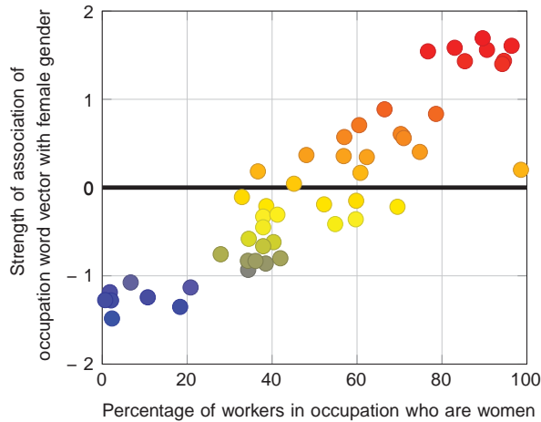
Fig. 1. Occupation-gender association. Pearson's correlation coefficient \rho = 0.90 with P < 10^{-18} .