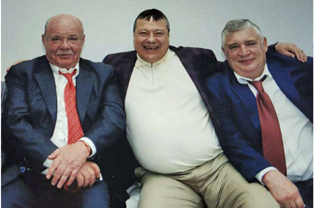
Left to right: Semion Mogilevich, Sergei Mikhailov, and Viktor Averin. According to Interpol, Mikhailov and Averin ran the huge Solntsevo crime gang, but Mogilevich was the “Brainy Don” who introduced sophisticated finance to the Russian Mafia.