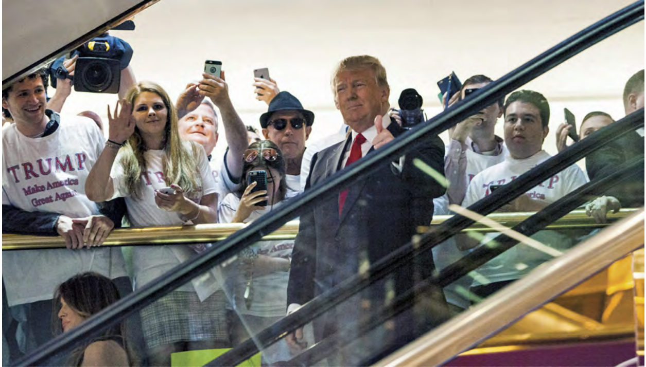
Donald Trump rides an escalator to a press event to announce his candidacy for the US presidency at Trump Tower on June 16, 2015, in New York City.