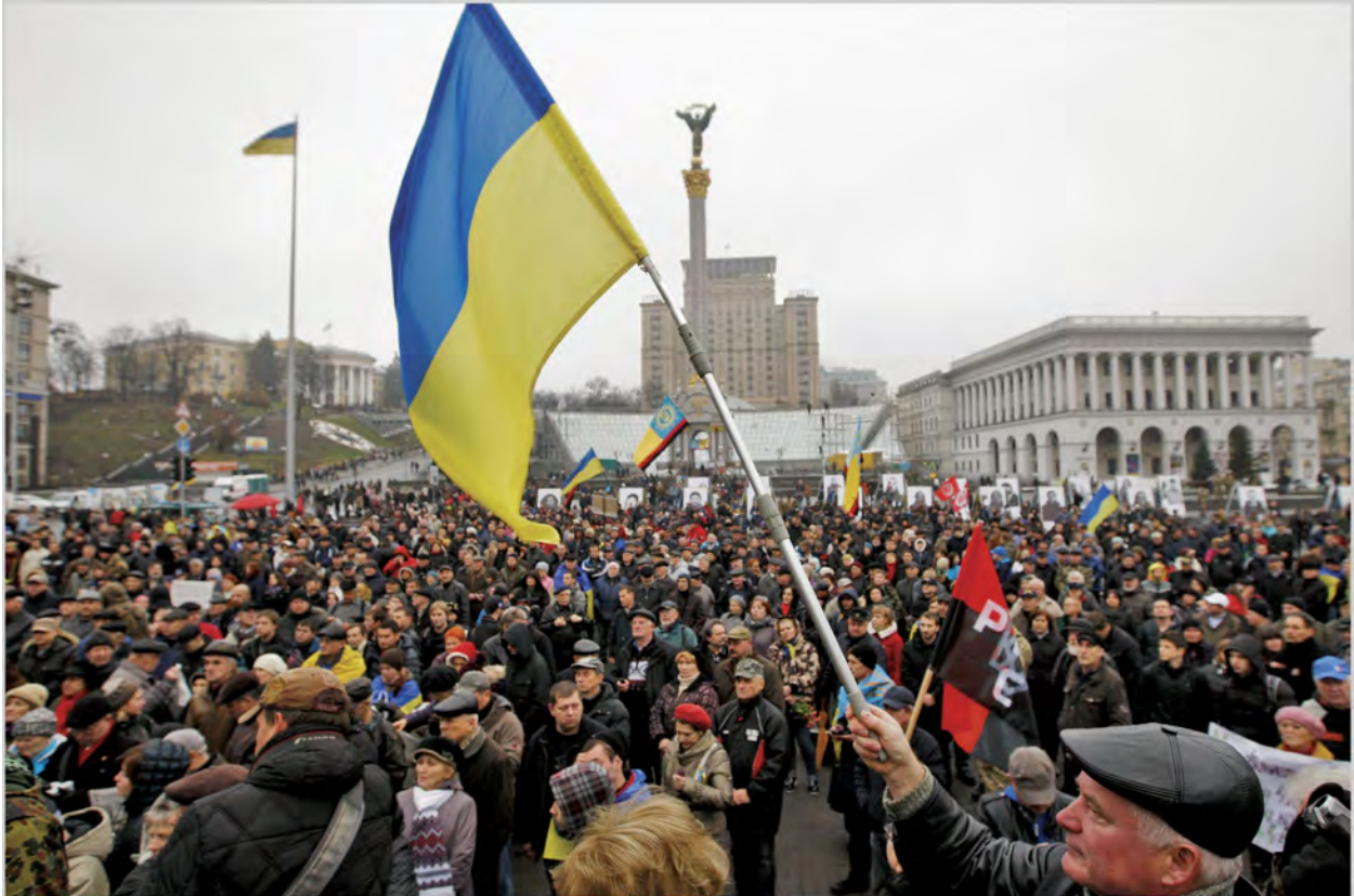
Ukrainians mark the second anniversary of the Euromaidan Revolution, which resulted in President Yanukovich's fleeing Ukraine to Russia under the protection of the Kremlin. One hundred thirty civilians and eighteen police officers were killed during the protests.