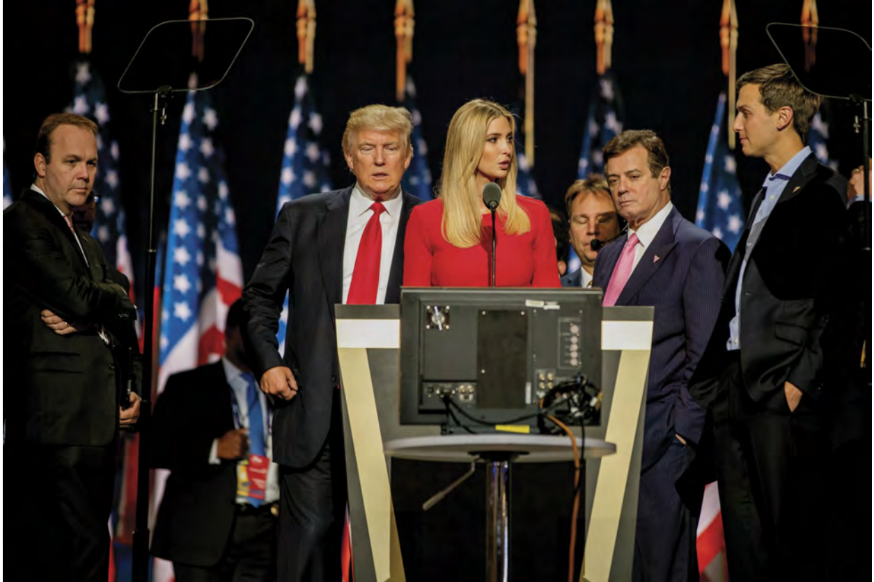
Trump's daughter Ivanka Trump ( center) onstage at the Republican National Convention in Cleveland, Ohio, July 21, 2016. From left to right are campaign adviser Rick Gates, Donald Trump, campaign manager Paul Manafort, and Ivanka's husband, Jared Kushner. At a time when Russian ambassador Sergei Kislyak was meeting with various members of the Trump campaign, the Ukraine plank in the Republican platform was changed in Russia's favor.