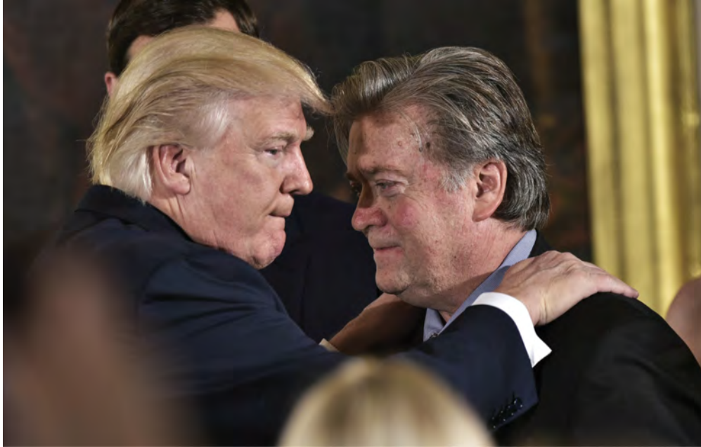
President Donald Trump ( left) and Stephen Bannon, who was chairman of Trump's 2016 campaign and had been vice president of Cambridge Analytica, a data-mining firm specializing in "psychographic" profiling as a way of microtargeting voters. CA's parent company, Strategic Communications Laboratories, had ties to Ukrainian oligarch Dmitry Firtash.