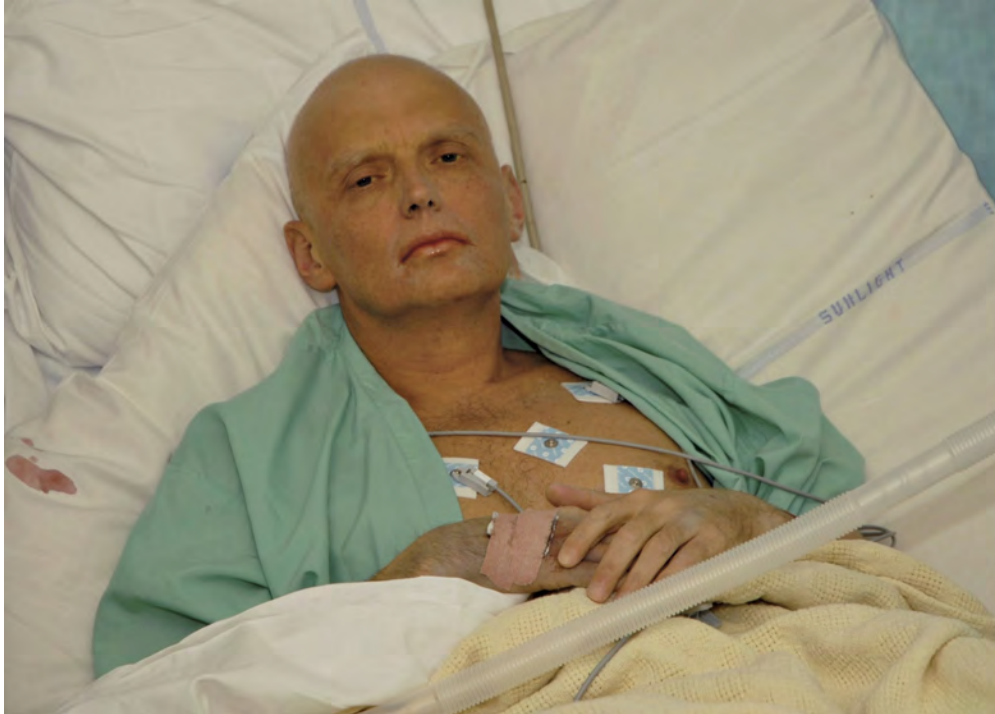
Alexander Litvinenko in the intensive care unit of University College Hospital in London, England, on November 20, 2006, three days before his death. The 43-year-old former KGB spy exposed Russian president Putin's ties to Semion Mogilevich and was poisoned with radioactive polonium-210 shortly afterward. He accused Putin of involvement in poisoning him.