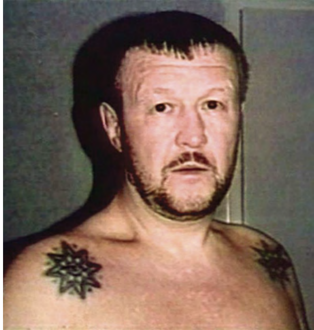
Brutal mobster Vyacheslav “Yaponchik” Ivankov was a high-level associate of Semion Mogilevich, a “thief-in-law,” and a Trump Tower resident. Ivankov made frequent visits to Trump’s Taj Mahal.