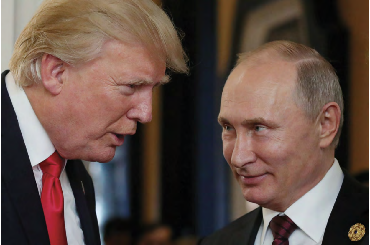
Together at last: Trump chats with fellow president Vladimir Putin as they attend the Asia-Pacific Economic Cooperation (APEC) Economic Leaders' Meeting in Da Nang, Vietnam, on November 11, 2017.