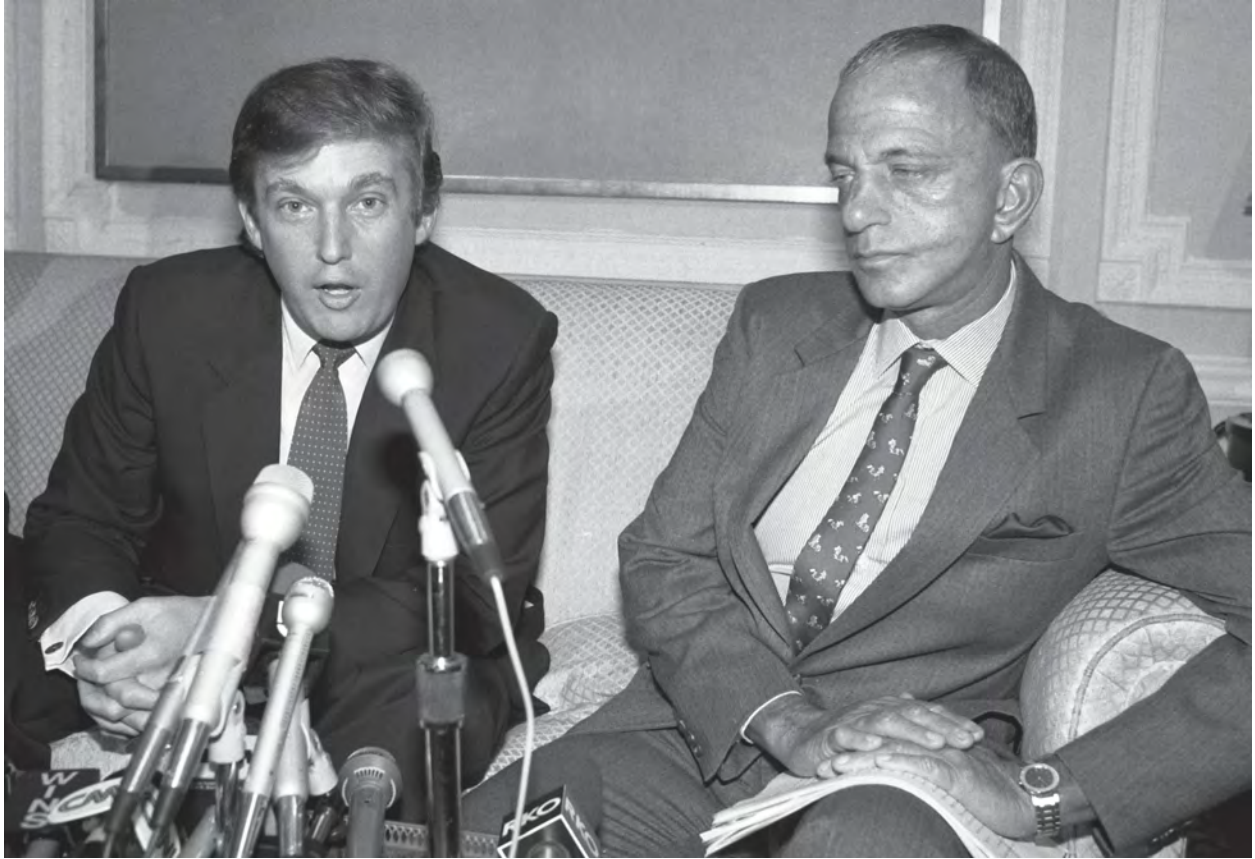
Donald Trump and his late mentor Roy Cohn in 1984. “I don’t want to know what the law is,” Cohn famously said, “I want to know who the judge is.”