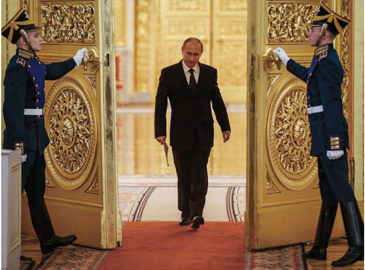
Putin assumed power in 2000 and has tightened his grip on Russia by rewarding his inner circle and eliminating anyone who poses a threat to him.