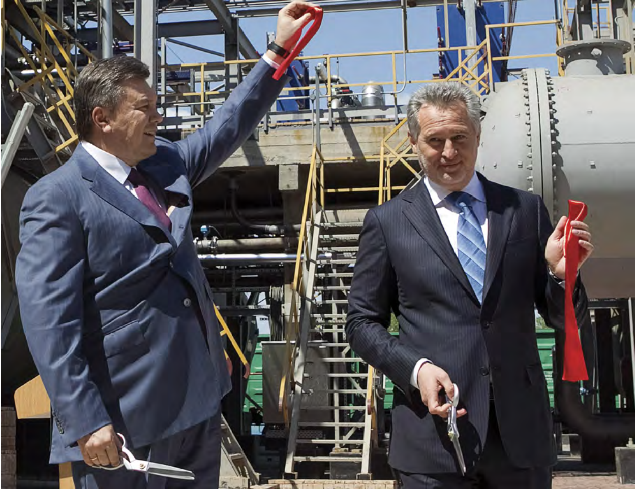
Dmitry Firtash ( right), one of Ukraine's richest men, with Ukrainian president Viktor Yanukovich ( left). Allegedly associated with Semion Mogilevich, Firtash made millions off the Ukraine energy trade, some of which went to Trump campaign manager Paul Manafort.