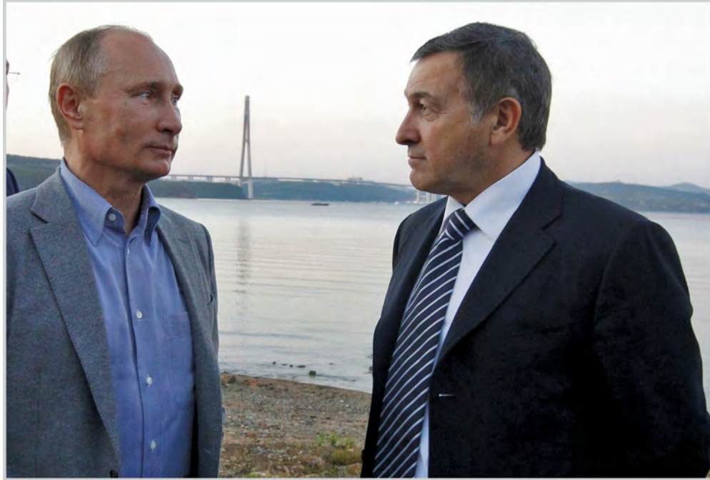
In September 2012, Russian president Vladimir Putin ( left) meets with Russian real estate billionaire Aras Agalarov ( right), head of the Crocus Group. Agalarov hosted the 2013 Miss Universe pageant with Trump in Russia and allegedly is an old drinking buddy of Sergei Mikhailov, head of the Solntsevo crime gang.