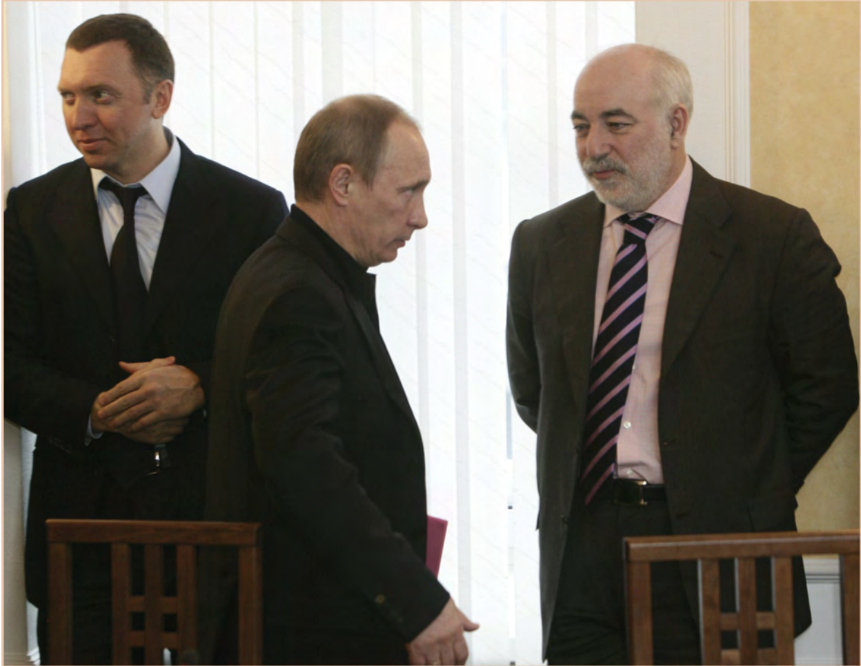
Russian prime minister Vladimir Putin ( center) with two of his closest confidantes, aluminum oligarch Oleg Deripaska ( left) and finance minister Viktor Vekselberg. Deripaska was promised Trump campaign briefings during the 2016 US presidential election by Paul Manafort, Trump's campaign manager. Vekselberg met Trump lawyer Michael Cohen after the election, and made a large contribution to Trump's inaugural fund shortly thereafter.