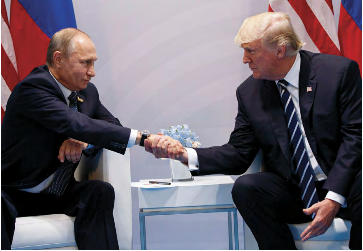
Vladimir Putin ( left) and Donald Trump ( right) during the G8 meeting. Putin has denied interference in the 2016 US presidential election, while the state media he controls has claimed, “Trump is ours.”