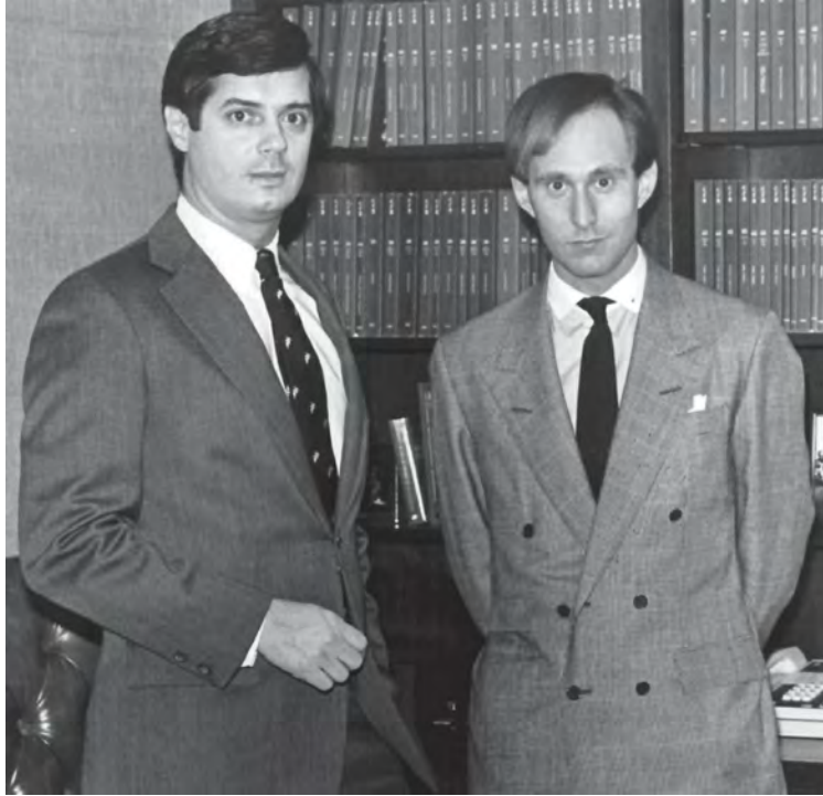
The Torturers' Lobby: Back in 1985, Paul Manafort and Roger Stone were young political operatives who reveled in taking on dictators as clients. Trump was an early client for the duo. Many years later, Stone advised Trump during the 2016 campaign while Manafort became Trump's campaign manager.