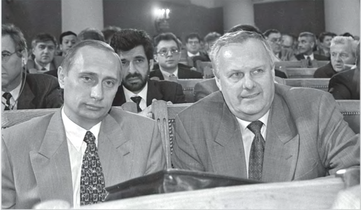
Mayor Anatoly Sobchak ( right ) and his assistant Vladimir Putin ( left ) attend a meeting of the St. Petersburg city legislature in 1993. At a time when billions of dollars' worth of Russia's natural resources were being privatized, Putin had a low-profile but powerful position.