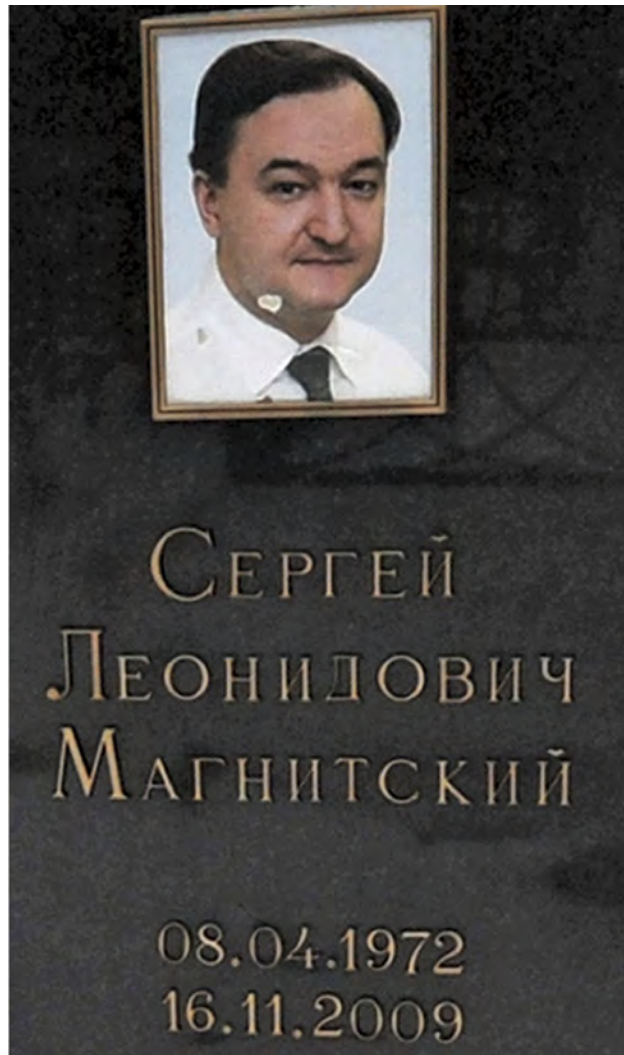
The tombstone of Russian lawyer Sergei Magnitsky, who was hired by Hermitage Capital's Bill Browder to investigate a $230 million tax fraud. For his efforts, Magnitsky was jailed, tortured, and killed while in a Russian prison—leading the US Congress and European Union to pass sanctions that targeted Russian human rights abusers.