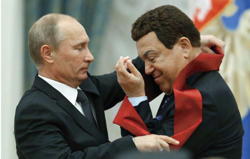
Russian president Vladimir Putin hands over a medal to singer Iosif Kobzon, aka “the Russian Sinatra,” during an awards ceremony in the Kremlin in Moscow, August 29, 2012. Kobzon is said to be a longtime favorite of Russian mobsters, often providing entertainment at events attended by members affiliated with the Russian Mafia.