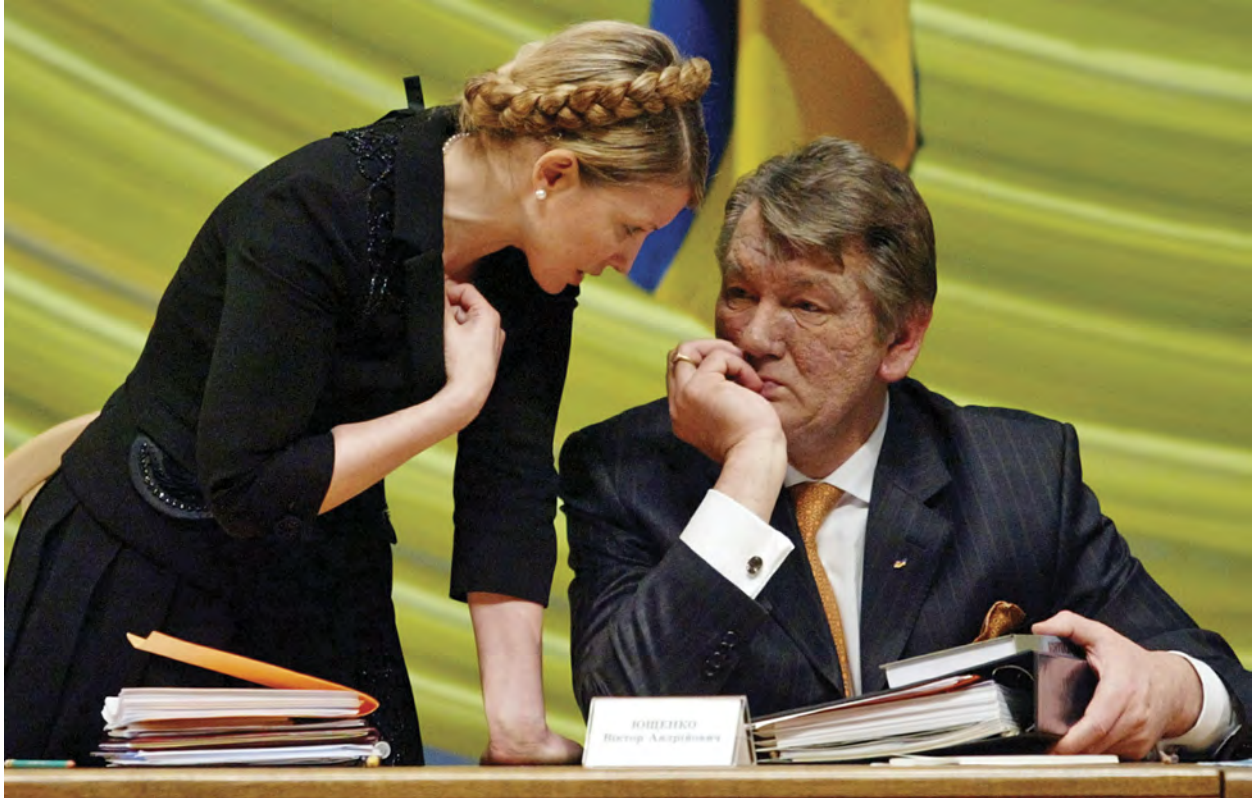
Ukrainian president Viktor Yushchenko listens to Prime Minister Tymoshenko during a meeting with representatives of local governments in Kiev. President Yushchenko suffered dioxin poisoning while running against Yanukovych during the presidential election of 2004.