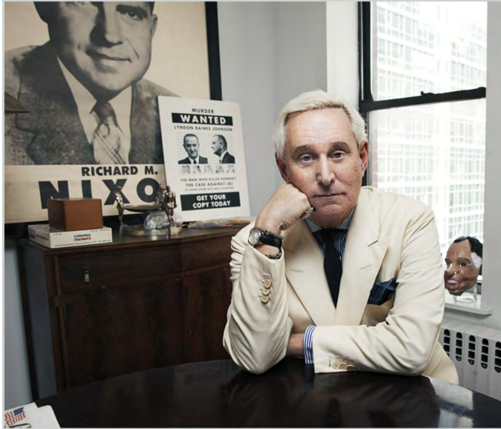
Political operative Roger Stone split with the Donald Trump campaign but allegedly played a major role in WikiLeaks' leaking of the DNC's hacked emails during the presidential election.