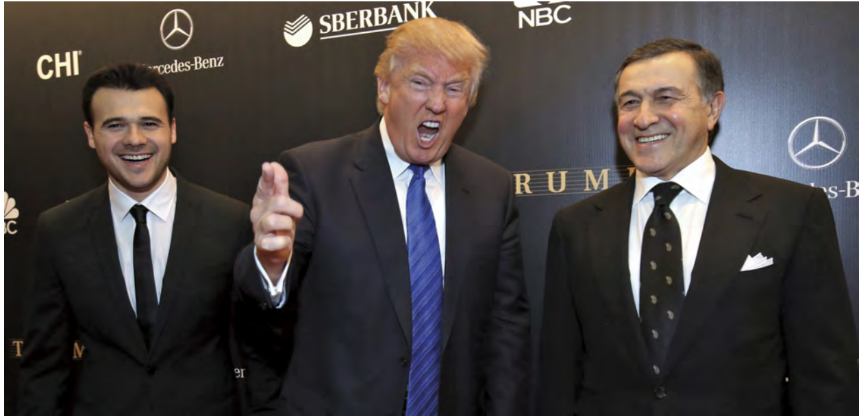
Crocus Group president Aras Agalarov ( right) and vice president Emin Agalarov ( left) arrive with Donald Trump ( center) for the 2013 Miss Universe beauty pageant final at Moscow's Crocus City Hall on November 9, 2013.