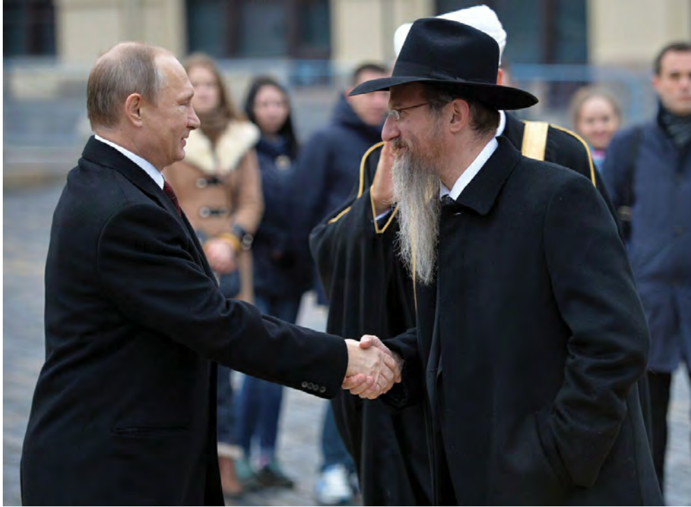
Russian president Vladimir Putin ( left) and Chief Rabbi of Russia Berel Lazar at a flower-laying ceremony at Red Square, November 4, 2015. Lazar's Chabad-dominated Federation of Jewish Communities of Russia, which was funded in part by two Putin confidantes, Lev Leviev and Roman Abramovich, also had direct ties to Trump.