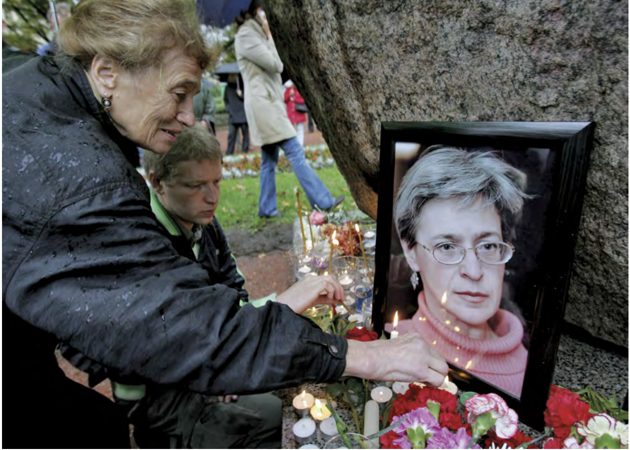
People light candles next to a portrait of Russian journalist Anna Politkovskaya during a rally in St. Petersburg on October 8, 2006. Politkovskaya, an outspoken critic of President Vladimir Putin, was shot dead at her apartment block in central Moscow.