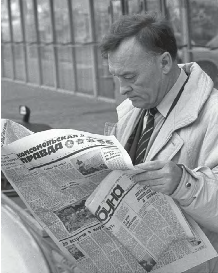
Oleg Kalugin, former head of foreign counter-intelligence for the KGB and Putin's former boss, says Russian intelligence probably had kompromat on Donald Trump from Trump's visit to Russia in 1987.