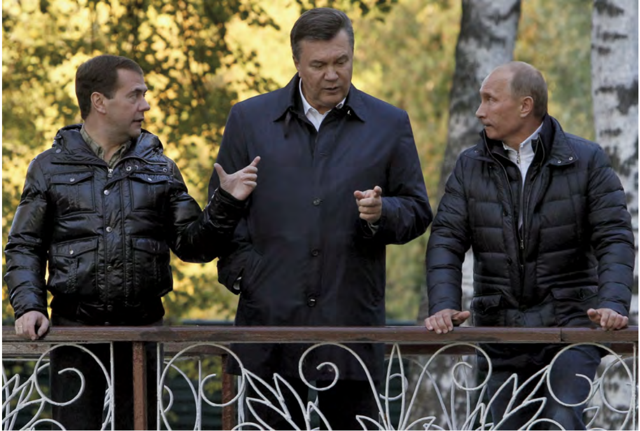
Russian president Dmitry Medvedev ( left) speaks with his Ukrainian counterpart, Viktor Yanukovich, and Prime Minister Vladimir Putin on September 24, 2011. Paul Manafort helped get the pro-Putin Yanukovich elected and remained with him for years.